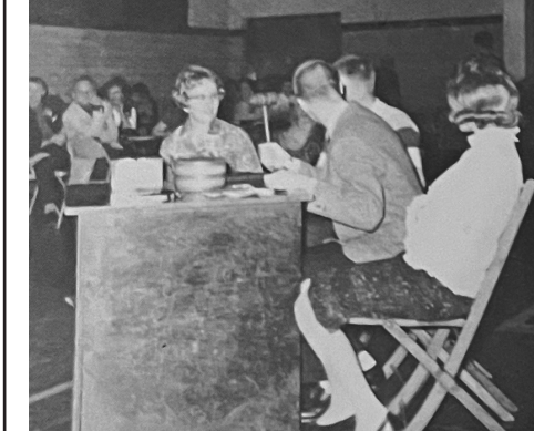
Comet Club activities from the 1962 MHS yearbook.

Editor's note: The Hall of Fame banquet missed two years, one during Covid and one during the transition from the Mason Alumni/Boosters to\ the\ Mason\ High\ School Athletic Dept, accounting for the extra two years between 1980 and 2022.